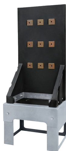
Blanking plugs cover unused live parts