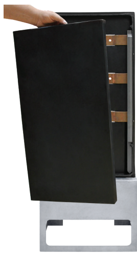
Fully encapsulated live buswork