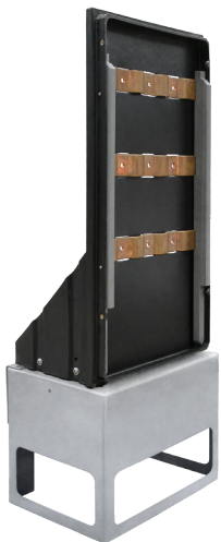
Solid Copper Busbar